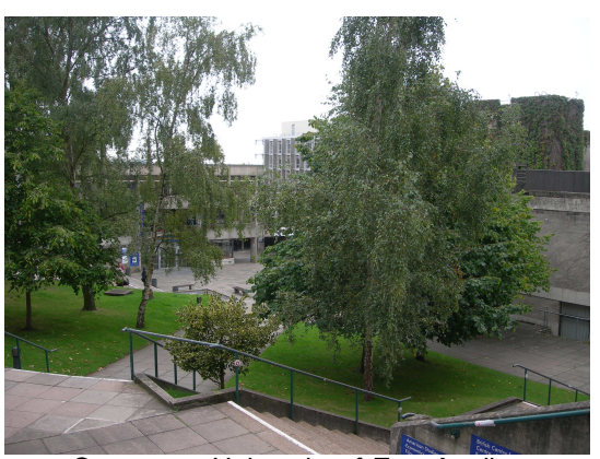
Campus at University of East Anglia

in", with session 1 of the meeting commencing at 11.30 am.